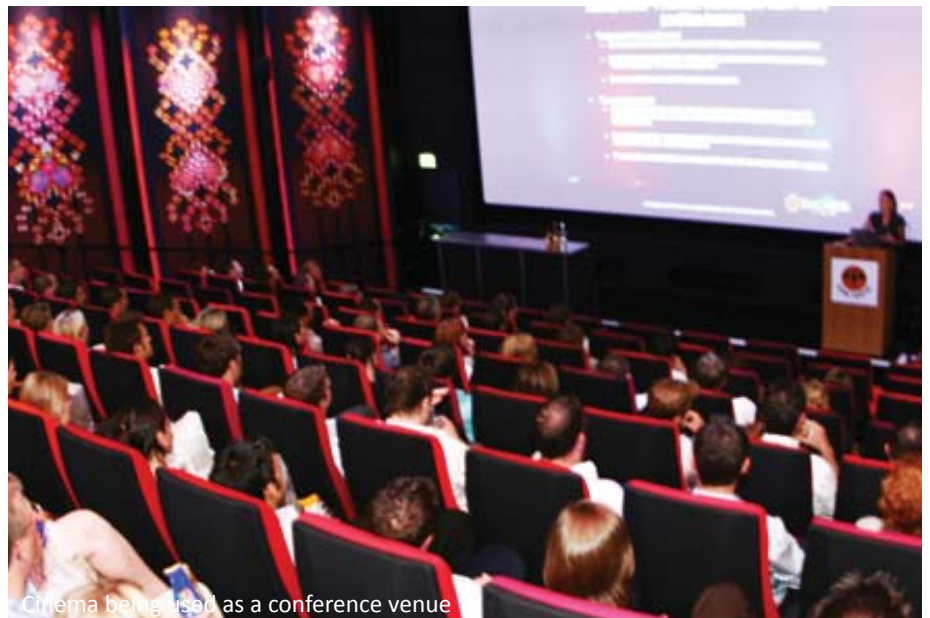
Cinema being used as a conference venue