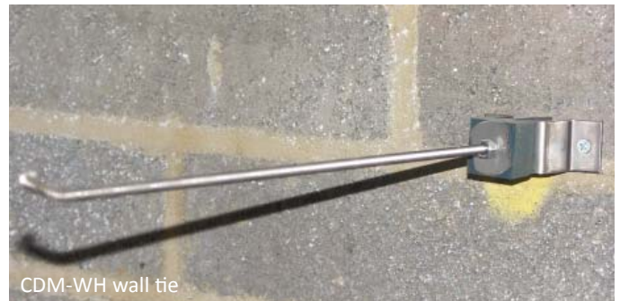
CDM-WH wall tie