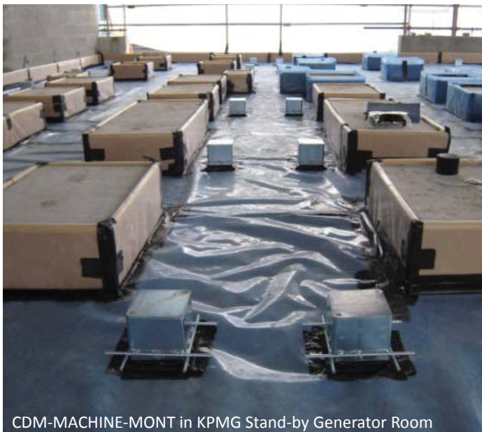
CDM-MACHINE-MONT in KPMG Stand-by Generator Room