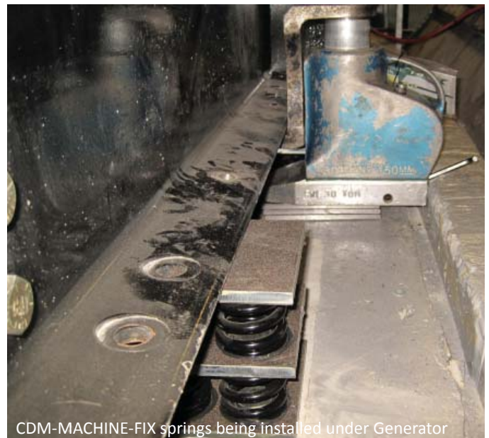
CDM-MACHINE-FIX springs being installed under Generator