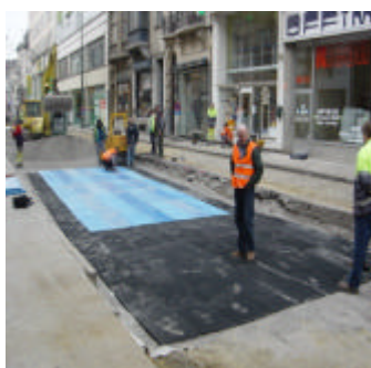
Installation of the resilient mat