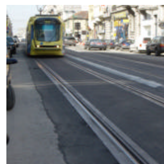
pouring of the concrete, installation of the track and road finish