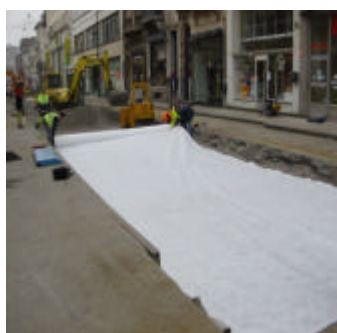
PE protection layer