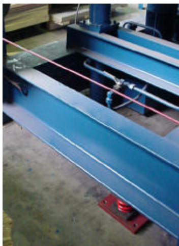
Setup with springs

The system can be tuned to any frequency of 1Hz or more.