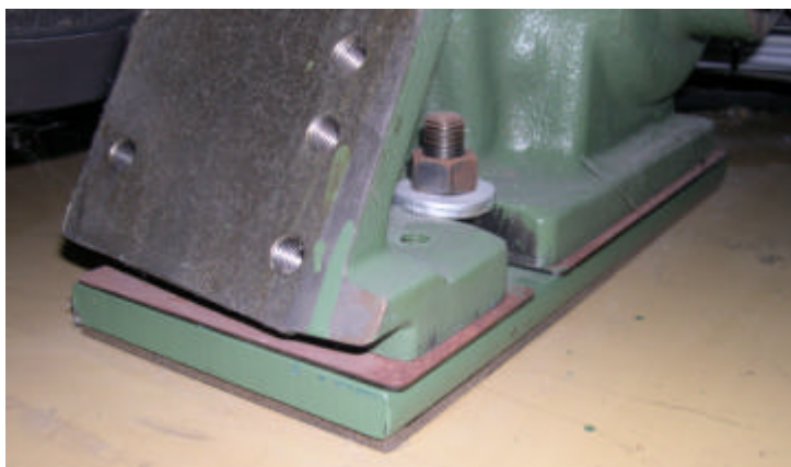
Setup with pads