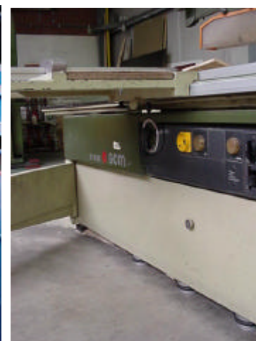
Setup with air cushions