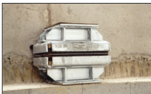
Some views on the vibration cut