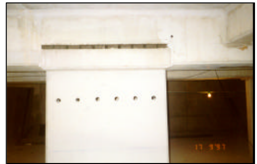
Some views on the vibration cut