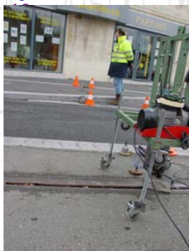
Test setup isolated zone

The performance of this floating slabtrack was tested in situ (*) at two sections: a section through the floating slabtrack (-20 dB) and a section in a non-isolated zone.