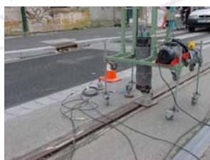
Test setup non-isolated zone

The performance of this floating slabtrack was tested in situ (*) at two sections: a section through the floating slabtrack (-20 dB) and a section in a non-isolated zone.