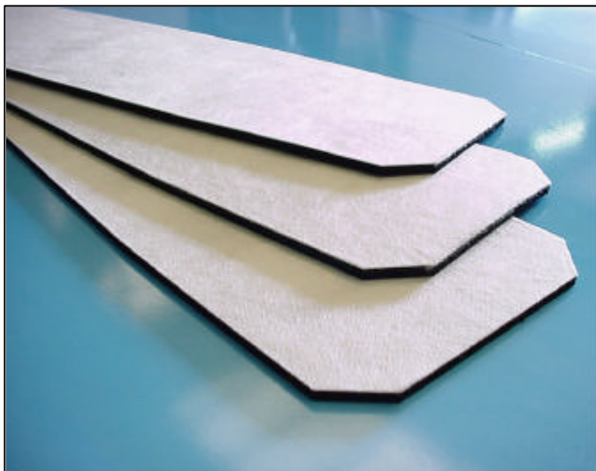
View of 3 recently produced CDM-USM