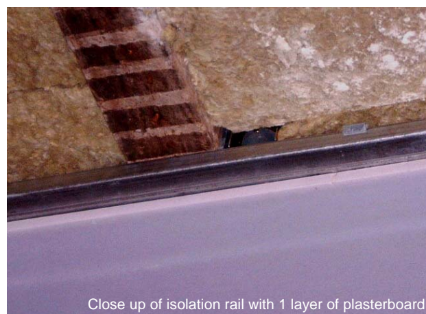
Close up of isolation rail with 1 layer of plasterboard