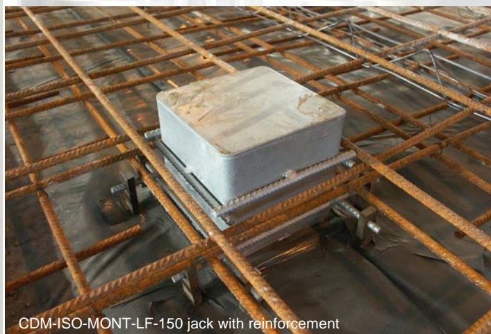
CDM-ISO-MONT-LF-150 jack with reinforcement

The finished project provides a high level of protection from re-radiated noise from the Central Line trains and also maximises sound separation between adjacent rooms.