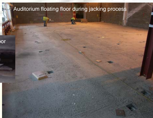
Auditorium floating floor during jacking process