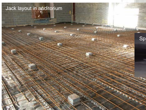
Jack layout in auditorium